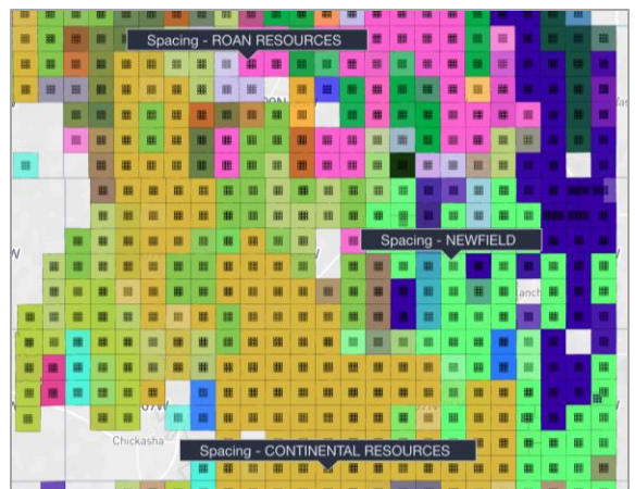
Spacings by Operator in the SCOOP